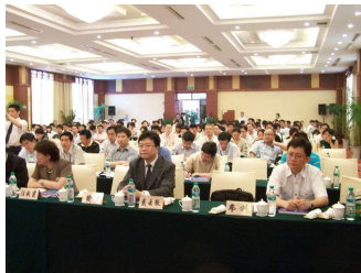
American Society for Quality.

He taught PS&LP seminars all around the world. He has taught his seminars throughout the United States, the UK, Europe, throughout China, as well as Thailand, Malaysia, Australia, and India. Some of his seminars in China had audiences in excess of 550 per event.